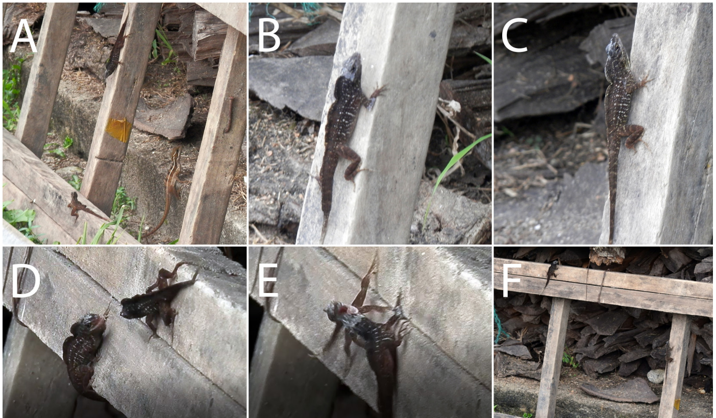
Fig. 1. Male-male aggression in Cuban Brown Anoles ( Anolis sagrei) in Honduras: (A) Invader oriented horizontally and resident in a vertical position; note also the presence of a Brown Basilisk ( Basiliscus vittatus), which is a known predator of smaller lizards; (B) resident male; (C) invading male; (D) defensive displays that preceded physical aggression; (E) males attacking and biting each other; (F) after the aggressive encounter, the invader withdraws from the resident’s territory and retreats to a nearby woodpile. A video of the encounter is available at: https://www.youtube.com/watch?v=ghdMrW0ThwY.